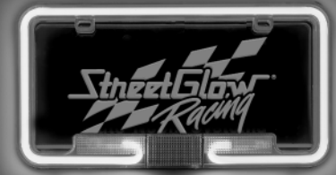
● Standard Mount Effect