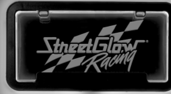
● Double Halo Effect